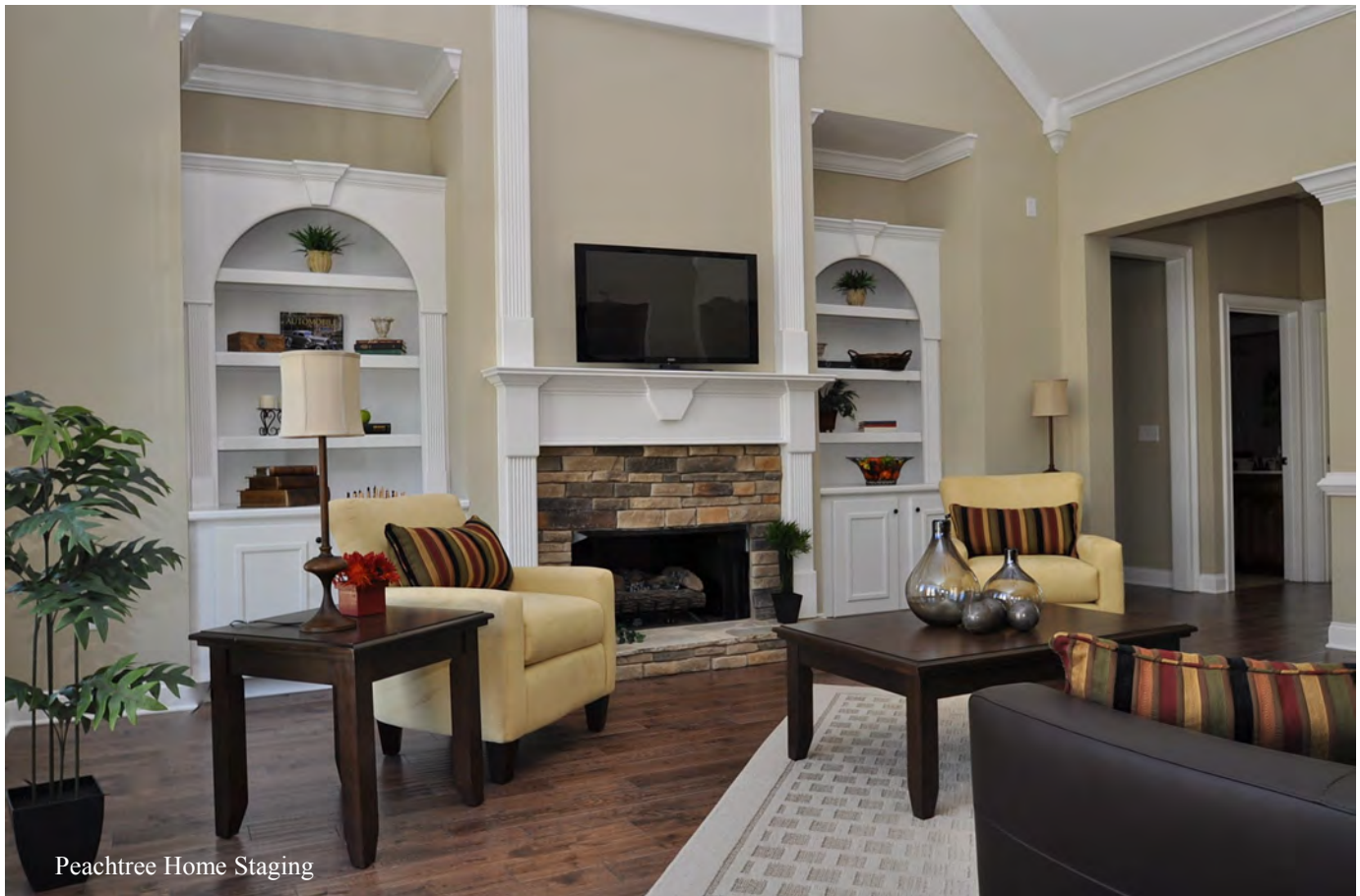
Peachtree Home Staging