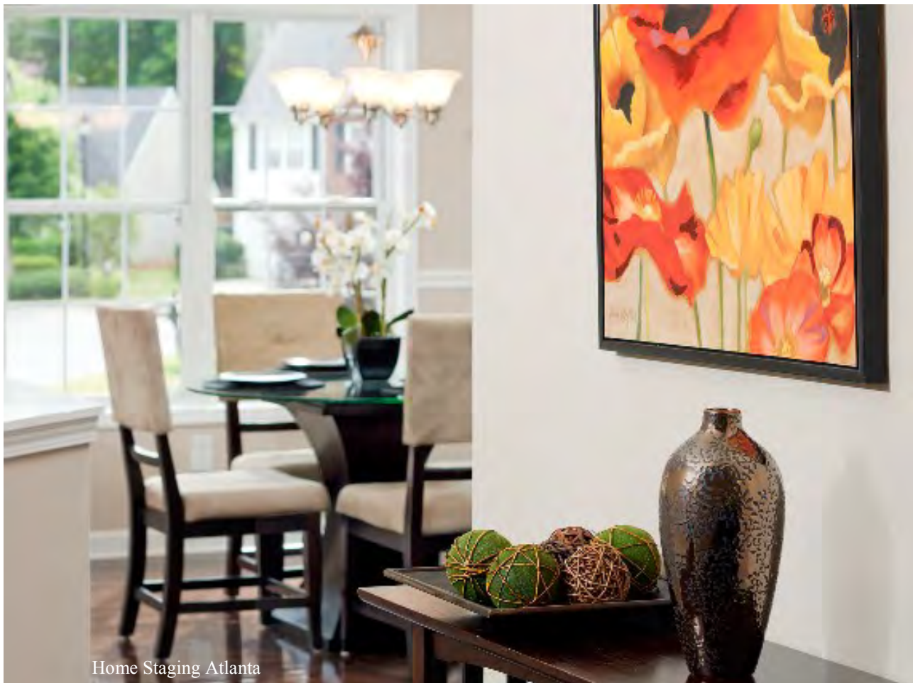
Home Staging Atlanta

Brought to you by the Real Estate Staging Association® Copyright 2008-2011 All Rights Reserved